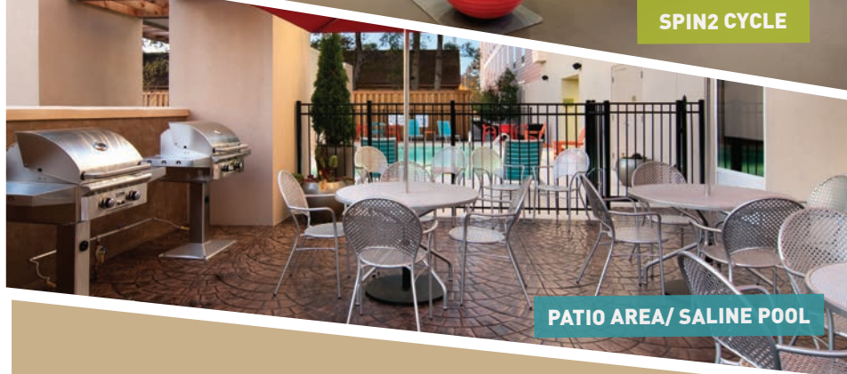
PATIO AREA/ SALINE POOL