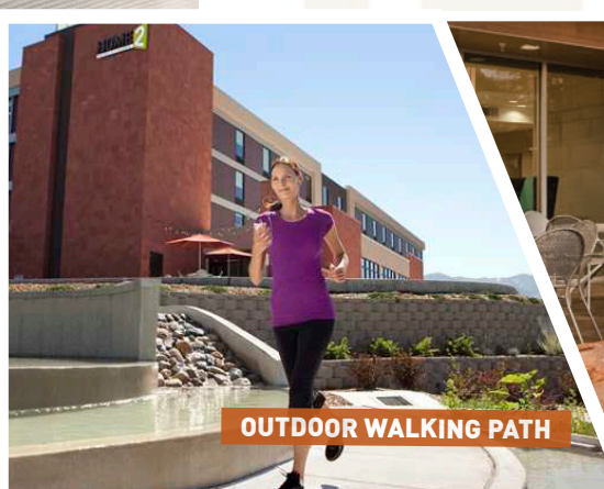
OUTDOOR WALKING PATH